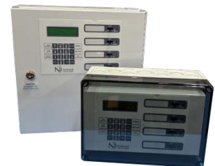
MC100 and MC100-WP Weather proof Master Clock