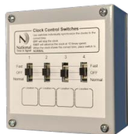
980-4-SA Manual Switches