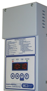
MC3 Master Clock